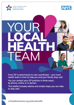
A5 double sided leaflet