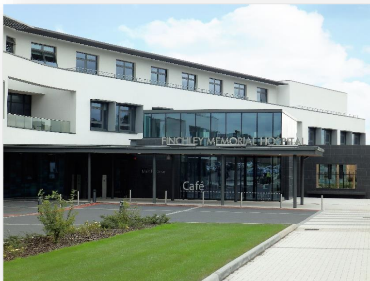
Finchley Memorial Hospital

The project won a 2024 HSJ Partnership Bronze Award for 'Healthcare Infrastructure Project of the Year'.