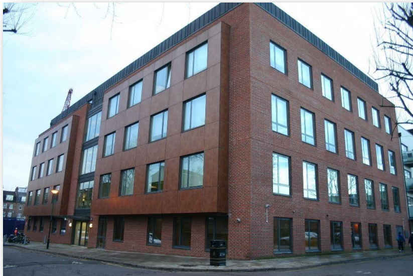
Andover Medical Centre Islington

This inclusive, joined-up and borough-wide perspective on the delivery of primary care services has further strengthened existing relationships between the ICB and the council and supported joint working on other priority schemes across the borough.