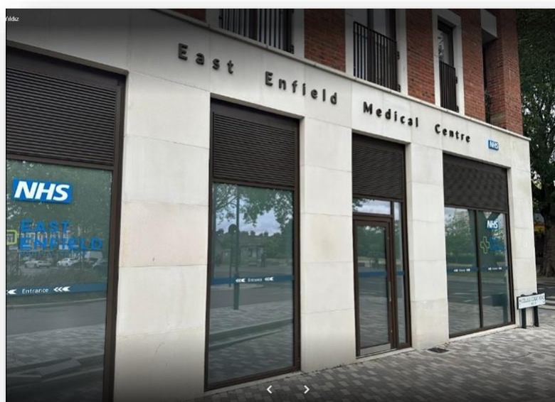
East Enfield Medical Centre