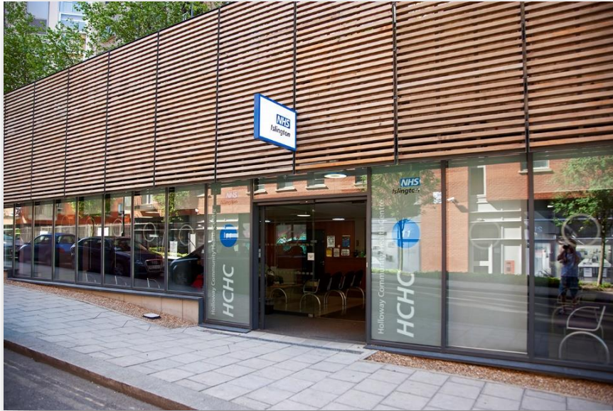
Holloway Community Health Centre