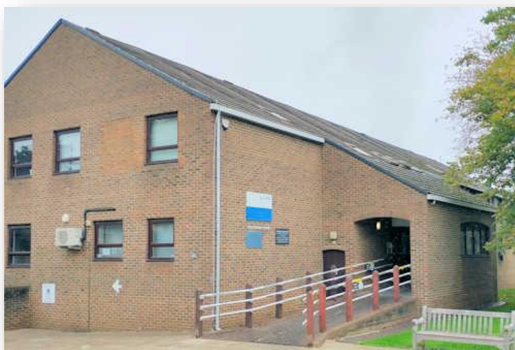
Torrington Park Health Centre