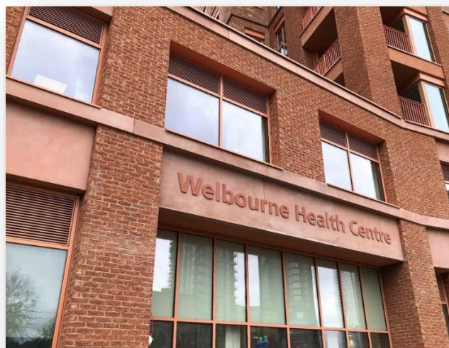
Welbourne Centre, Tottenham Hale

Set over three floors, the new centre features 24 spacious consultation rooms, as well as a variety of other spaces for clinicians including GPs, pharmacists, and more. It also allows the centralisation of the Lawrence House Group’s call centre team, with improved technology helping them to provide better support for patients.