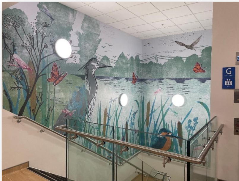
Wood Green CDC stairwell – mural by local artist Phoebe Swan