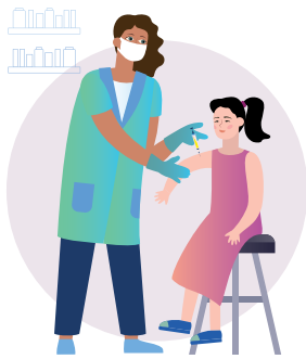
HPV vaccination of adolescents

To protect women from the devastating effects of cervical cancer, WHO calls for: