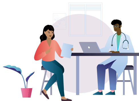
Regular screening tests for cervical cancer and quality treatment