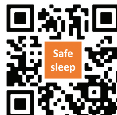
Safe sleep for babies