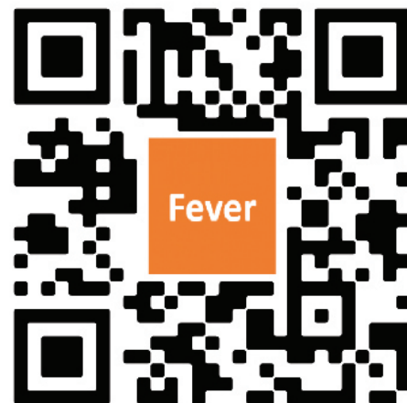
Fever in children