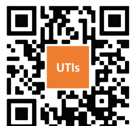
Urinary tract infection