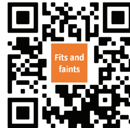
Fits, faints and funny turns