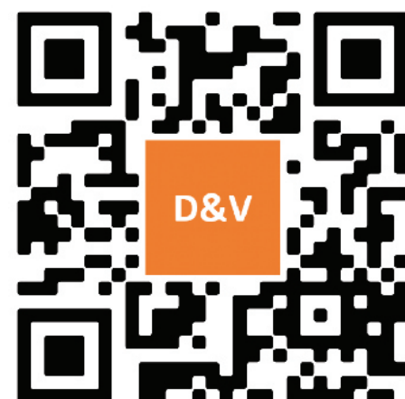
Diarrhoea and vomiting