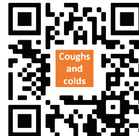
Coughs and colds