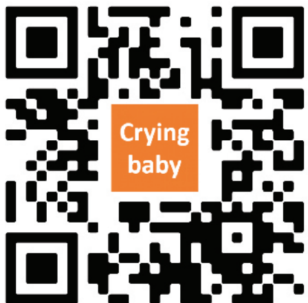
Crying baby (under 3 months)