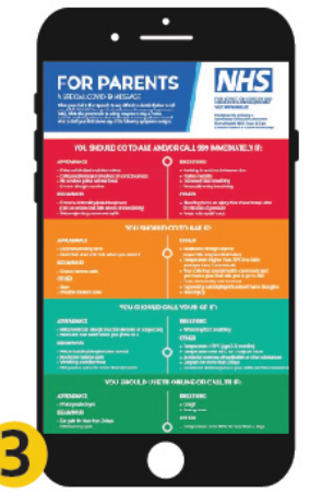
3 View landing page The URL is opened in a browser to display a mobile landing page.