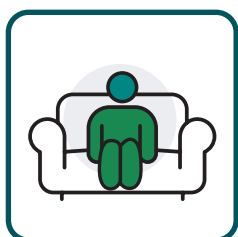
Sitting up for a length of time

A child with Long COVID might have trouble with everyday activities that they used to do. This includes things like: