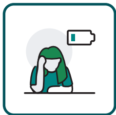
Fatigue (extreme tiredness)

There are many possible symptoms, and a child might have one or more. Symptoms can come and go over time. The most common symptoms are: