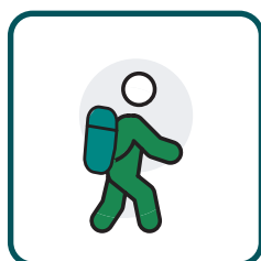
Doing daily tasks