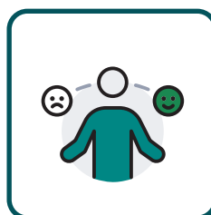
Having control over their emotions